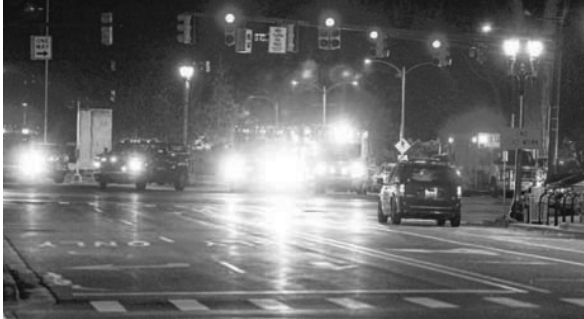
Police vehicles are at the scene of a shooting on the campus of Michigan State University on Tuesday