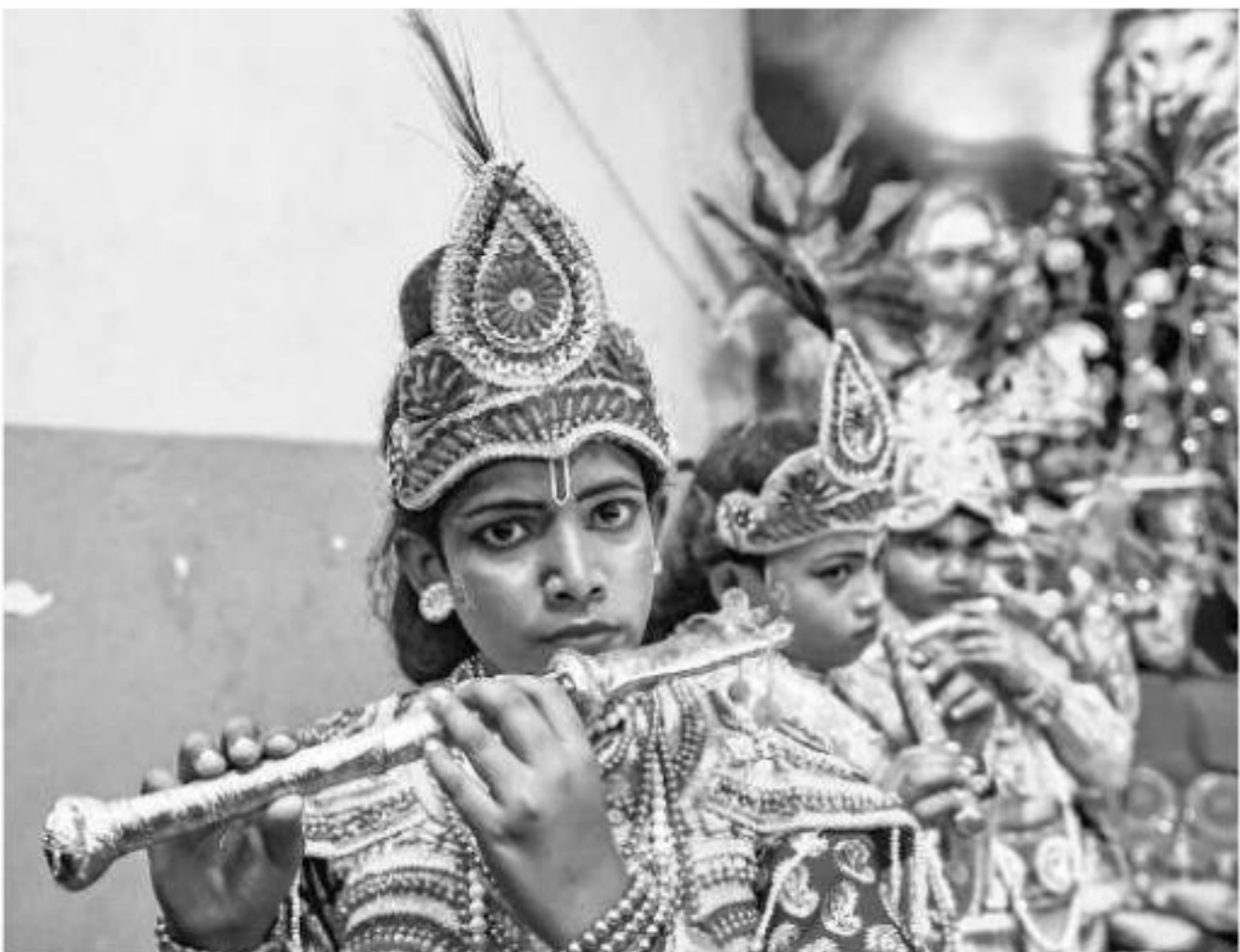
Children dress up as Lord Krishna on the occasion of Janmashtami festival in Kolkata, on Friday