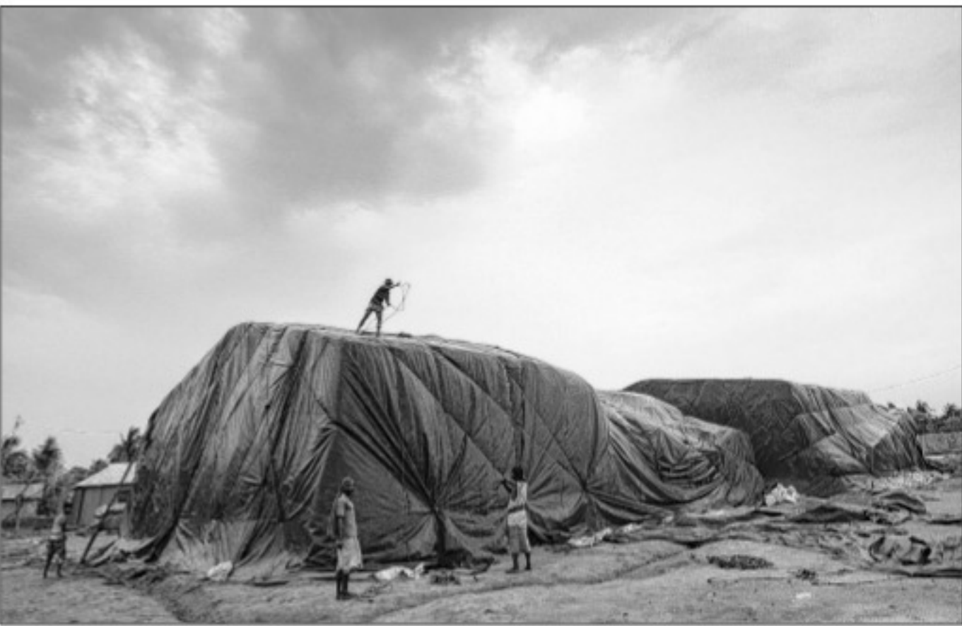
Workers cover a pile of fertiliser in Khulna, Bangladesh, even as the storm approaches.

Bangladesh skyline turned dark in many parts of the country since noon as 'Fani', dubbed to be the deadliest cyclone in decades to hit the region, started approaching, albeit with an weakened force, after ravaging India's eastern Odisha coastlines, weather officials said.