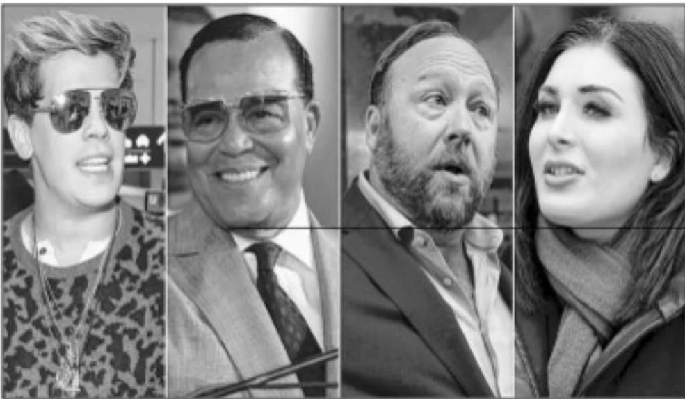
(From L) Milo Yiannopoulos, Louis Farrakhan, Alex Jones and Laura Loomer

Decried as censorship by several of those who got the axe, the move signals a renewed effort by the social media giant to remove people and groups promoting objectionable material such as hate, racism and anti-