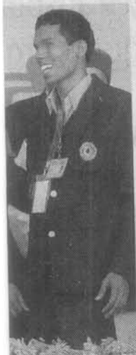
Narendra Modi 'Divyang' (disabled) child while assistive devices at Varanasi on Friday.

Speaking earlier in Varanasi, his Lok Sabha constituency, the prime minister said corruption had come down considerably since he took office in May 2014 as his government had "tightened nuts and bolts". He said he had also eliminated middlemen from government work, and that welfare schemes were being implemented faster and other projects too were being fast-tracked. Ahead of the meeting, the prime minister flagged off the Mahamana Superfast Express train which will link Varanasi and New Delhi thrice a week. The train will start plying from January 25.